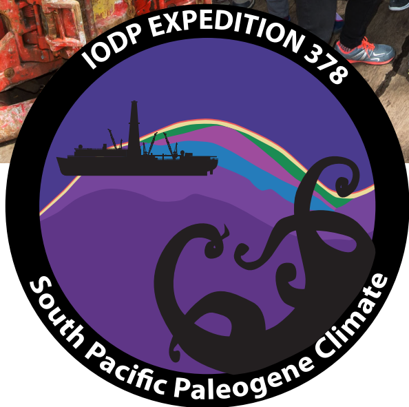
top: The Expedition 378 Science Team on board the JOIDES Resolution. inset: The Expedition 378 logo.

emissions continue unabated. By studying ocean sediments deposited during this period we aim to discover the impact of a warmer climate on high latitude regions (such as the UK, which is at 55° N), in particular on ocean physical, chemical and ecological properties.